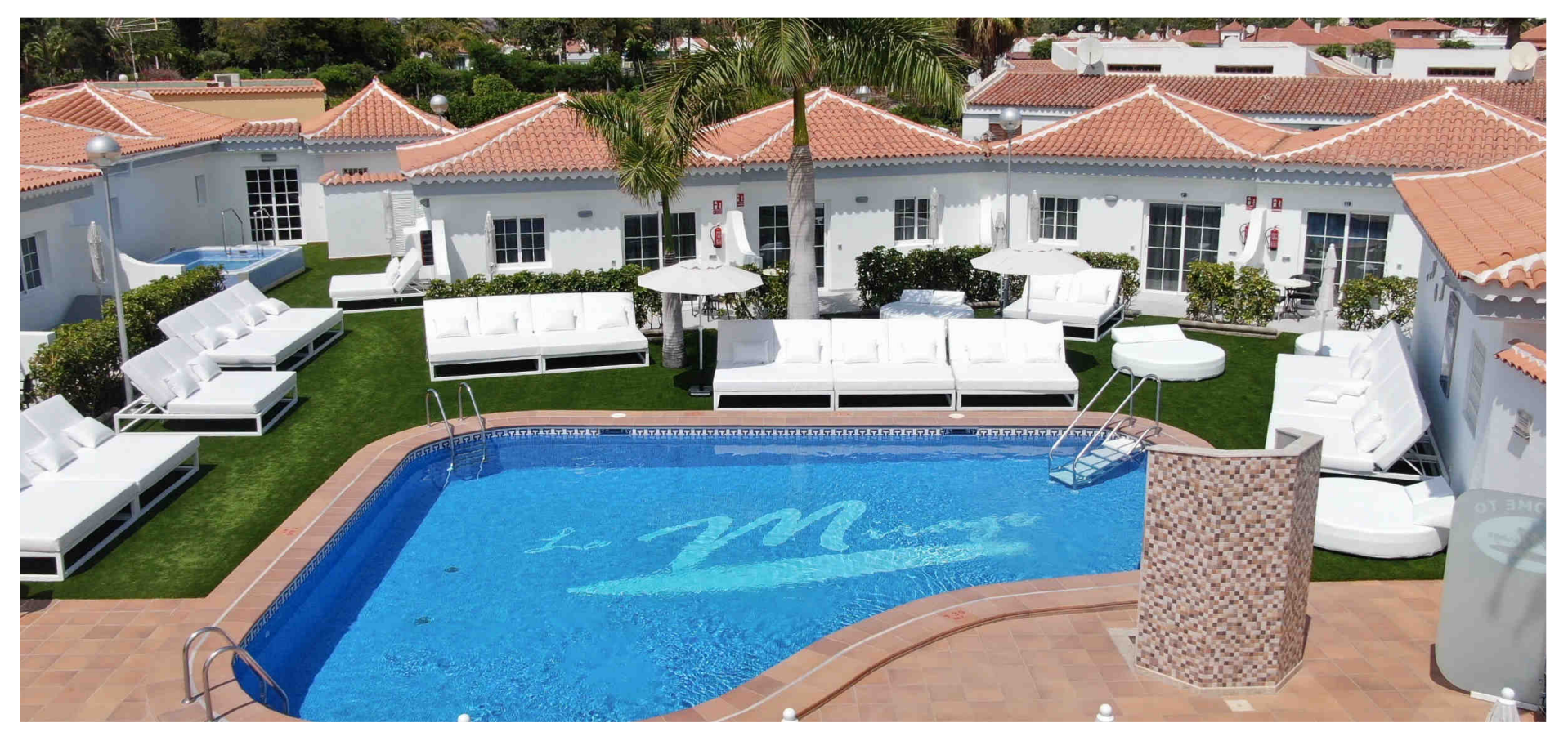
La Mirage Swingers